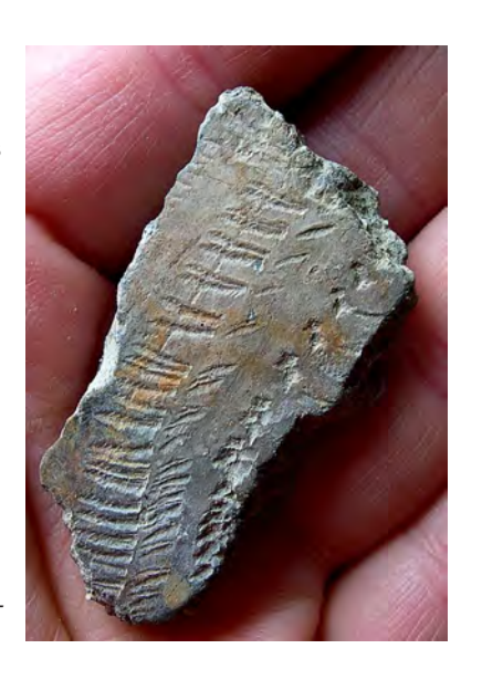
Dentate rocker stamped pottery sherd

The herons are doing it even better while the eagles look on expectantly. River otter, raccoons, stripers, and mink are all taking part in feast. The late night eels of fall slipping downstream to the black depths of the Kennebec on their way to the Sargasso Sea. Above the eels are the progeny of the spring river herring, the millions upon millions of young pouring downstream like a silver scaled avalanche to the Atlantic. I know why the Abenaki were here. I know why the colonists were here. The richness of this place is.... astounding.