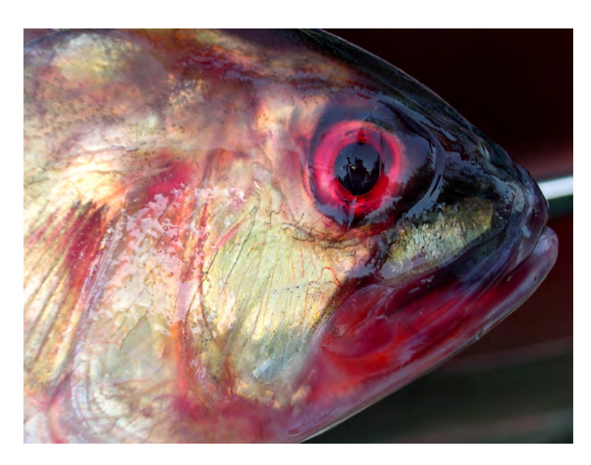
American Shad- Ed Friedman

Printed on Genesis Writing. 100% Recycled, 100% post-consumer waste, processed chlorine-free.